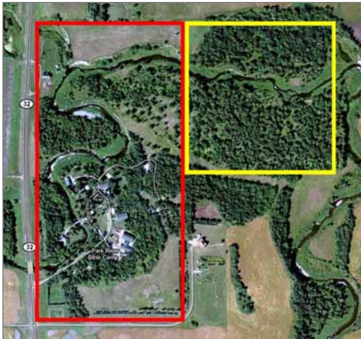
The red line marks the 80 acres already owned by PRBC, and the yellow line marks the 40 acres recently purchased. Both lines are approximate.