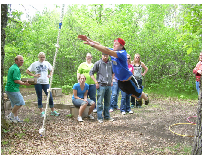
(Staff training on the Low Adventure Course)

leadership. Choice Dollars can be directed to Lutheran organizations nationwide. If you are eligible to direct Choice Dollars to one of the enrolled organizations, Thrivent will notify you. Please consider designating some or all of your Choice Dollars to Park River Bible Camp. Call (800) 847-4836 or go online to www.thrivent.com/thriventchoice, click on the red "Get Started" button, and enter "Park River Lutheran Bible Camp" as the organization name.