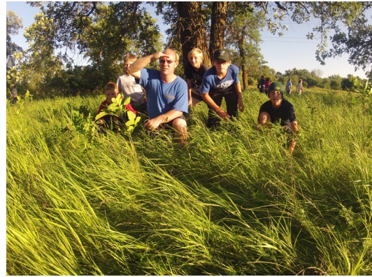
(Campers enjoying an outdoor game)