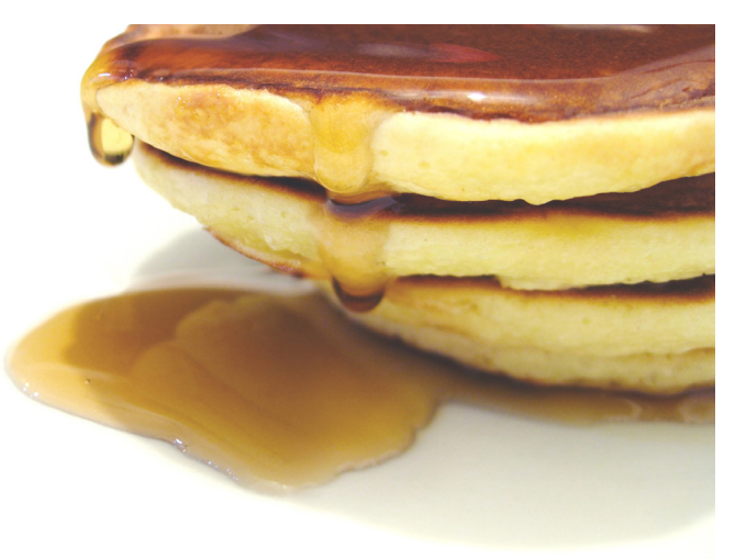
(Pancake Dinner on Sunday, April 28 @ PRBC)

Look for the next Proclaimer in electronic form in June 2013. Visit our website to sign up for email delivery.