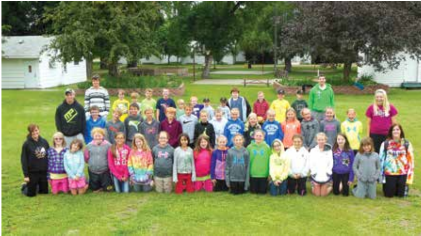
Rockin' Rangers Mini Camp!