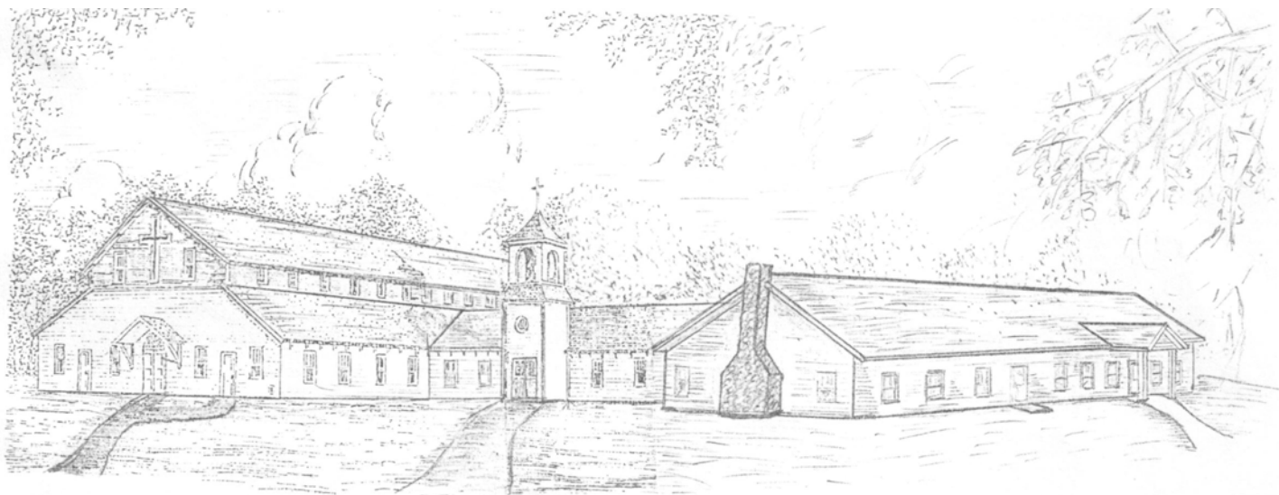
Chapel at Park River Lutheran Bible Camp